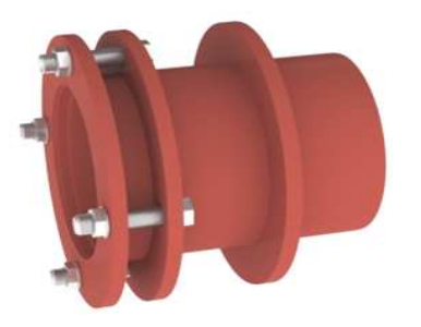
Figure 3. – Pressure stuffing box

The most complex design has – pressure gland (Figure 3). A product of this type is a double case (rather than a single case, like a sleeve or a stuffed box gland). Both the one and the second housing of the