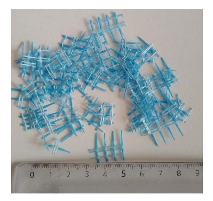
Fig. 1.Waste alkali-resistant glass mesh

The research object in this work is cement slabs reinforced with waste alkali-resistant glass mesh GMP-160(100)-1800/1800OJSC «Polotsksteklovolokno» (fig. 1). The main characteristics of the grid: fiber length – 20-25 mm; nominal weight – 160 g/m<sup>2</sup>; breaking load – 1800H; chemical resistance – very high. The research subject is the strength of concrete for pressing on an elastic base.