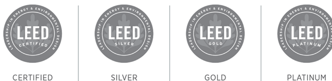
Figure 2. – LEED rating levels [16]

Based on the number of points achieved, a project earns one of four LEED rating levels (Figure 2.):