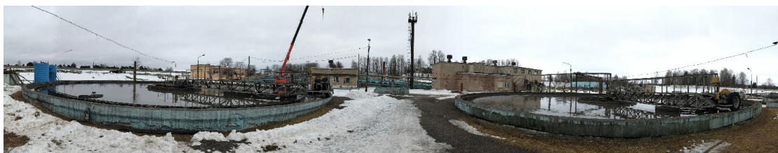
Fig. 2. Photo of primary sedimentation tanks applied for investigation: in the left side the clarifier No 4 with equipment for sludge recirculation, in the right side the clarifier No 1 operating in normal settling regime

Duration of preliminary tests – 1.5 month. The first four weeks of the experiment were dedicated to the adaptation of hydrolysis process, therefore, the samples were not taken during this period. Later, the momentary samples of wastewater and sludge were taken on every business day at the same time of the day. The samples of wastewater were taken before the primary sedimentation tanks and after the primary sedimentation tanks No. 1 and No. 4, the samples of sludge – from primary sedimentation tanks No. 1 and No. 4, the sample of removed sludge. In addition to sampling, other measurements were taken, i. e. the level of sludge in tested sedimentation tanks, duration and amount of removed primary sludge, levels of wastewater discharged from primary sedimentation tanks in the overflow channels at the moment of sampling. The latter levels allowed to determine the proportion of distribution of the flow between sedimentation tanks. The daily discharge of the wastewater treatment plant was recorded during the research which was measured with ultrasonic flow meter DNEPR 7 (tolerance – 2 %) in a pipe of the diameter of 1,200 mm between grit chambers and primary sedimentation tanks.